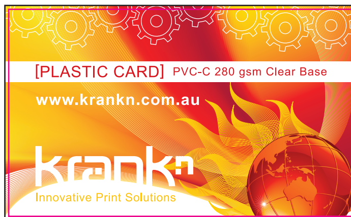
Sample set up - CMYK front